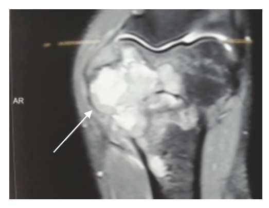
Fig. 3: T2W MRI Image showing Lytic Foci at the Medial Epicondyle with Fluid Level within the Lesion