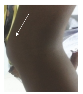
Fig.1: Photograph showing the Swelling at the Distal End of Humerus

Patient is to be reviewed after 6 months for assessing reduction in the size of the tumour, followed by surgical treatment.